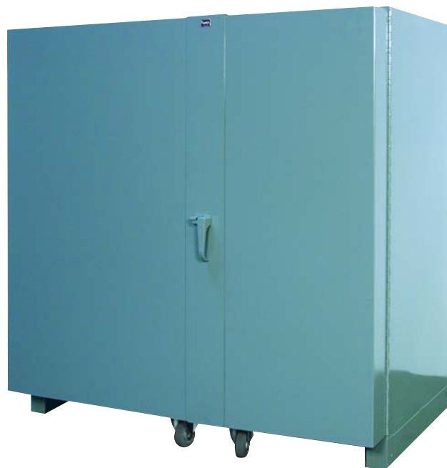
Contents are safe and secure behind Lyon's heavy-duty doors

IMPORTANT: Other drawer sizes are available. Contact Lyon at 1-800-323-0082 for details.