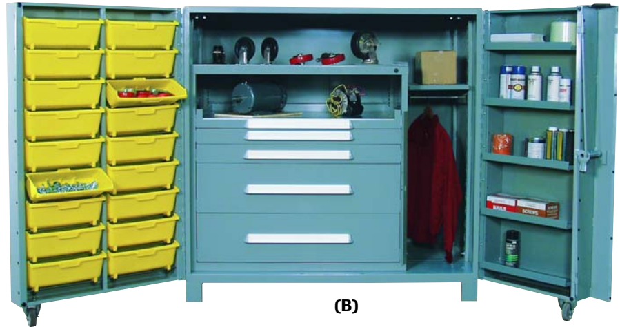
400 lb. capacity roll-out shelf

*Interior drawer dimensions, all drawers are 25⅞"d