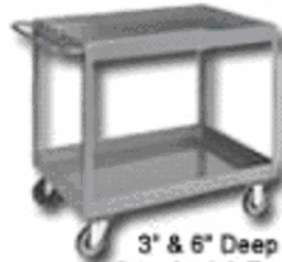
3' & 6' Deep Lipped Standard & Ergo Handle