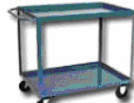
High Deck Cart 2 & 3 Shelf