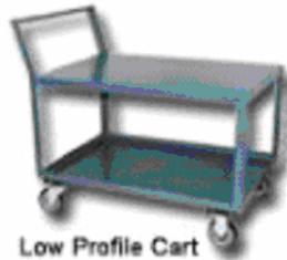
Low Profile Cart

Locking drawer -- 5"H x 16"W x 20"D Writing Stand -- 12"L x 24"W Casters -- 5" Urethane, 6" Hard Rubber -- 8" Phenolic (plastic)