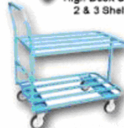
Tubular Heavy Duty Cart