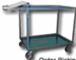
Order Picking Cart 2 & 3 Shelf