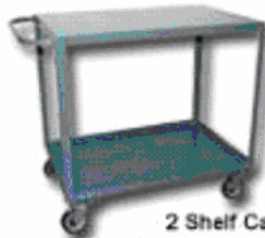
2 Shelf Cart 2000 lb. & 4000 lb. cap.