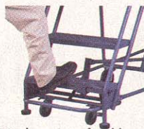
SAF-T Lock on G-Perf Ladder